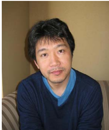
Director Hirokazu Kore-eda

The children in Nobody Knows are filmed with an intensity and naturalness reminiscent of a good documentary. Kore-eda went to great lengths to make this possible. He shot the film in chronological order so as to capture the increasing closeness between the young actors over time. He also spent a significant amount of time communicating with the actors, exploring their inner characters and encouraging feedback. The 14-year-old lead actor, Yuya Yagira, was awarded the Best Actor prize at Cannes in 2004 - the youngest, and the first Japanese, actor to receive the award.